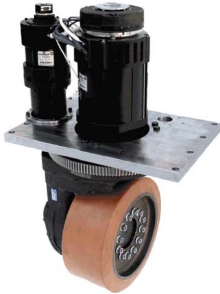
Vertical motor drive unit

Wheel \varnothing 230 - 406 mm Load 1,000 – 4,200 kg Power 0.8 - 8 kW With or without steering